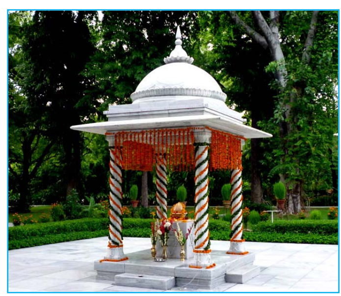
Sri Aurobindo's sacred relics enshrined 5 December 1957 at Delhi Ashram

9 December Anniversary of Sri Aurobindo's Samadhi Day